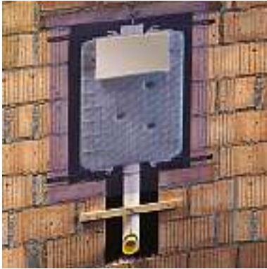
The blue net protects the cistern and gives a basis onto which plaster can directly be applied.

of modern bathroom design, utilizing wall hung technology, or floor standing WC, and with it, the design freedom to provide solutions in even the smallest of rooms.