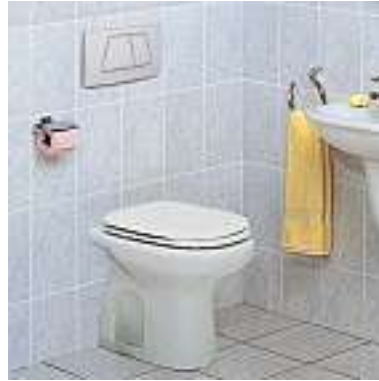
Modern design in front of the wall